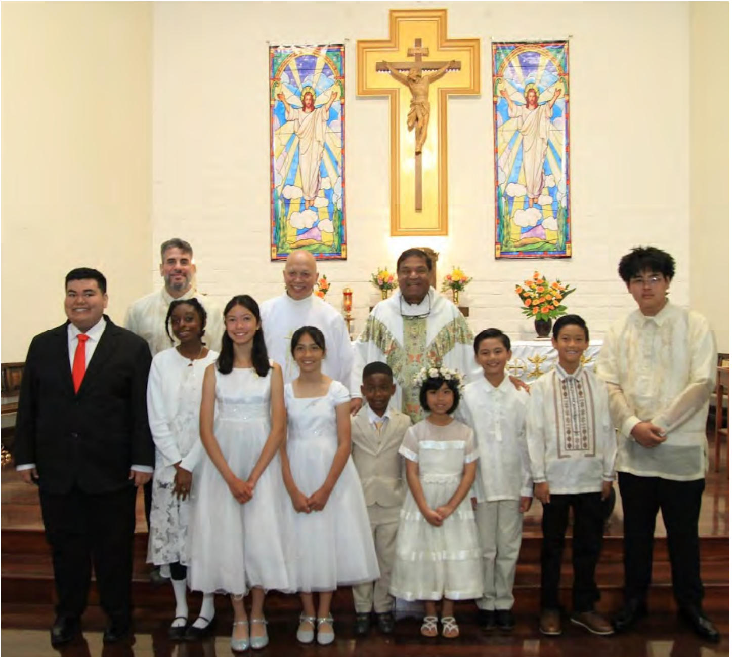
First Communion May 17, 2026