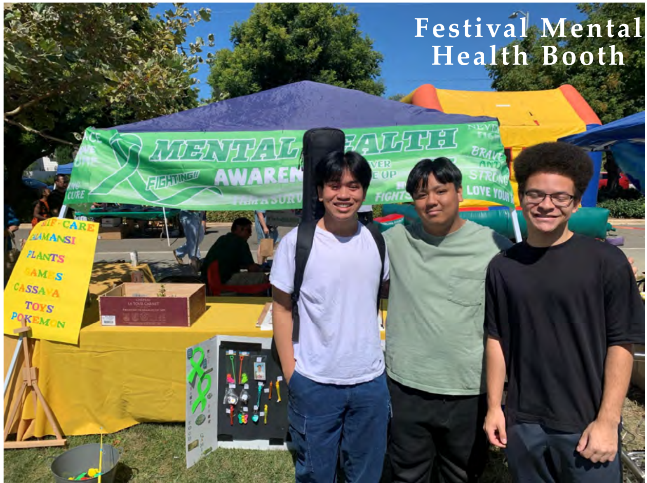
Festival Mental Health Booth