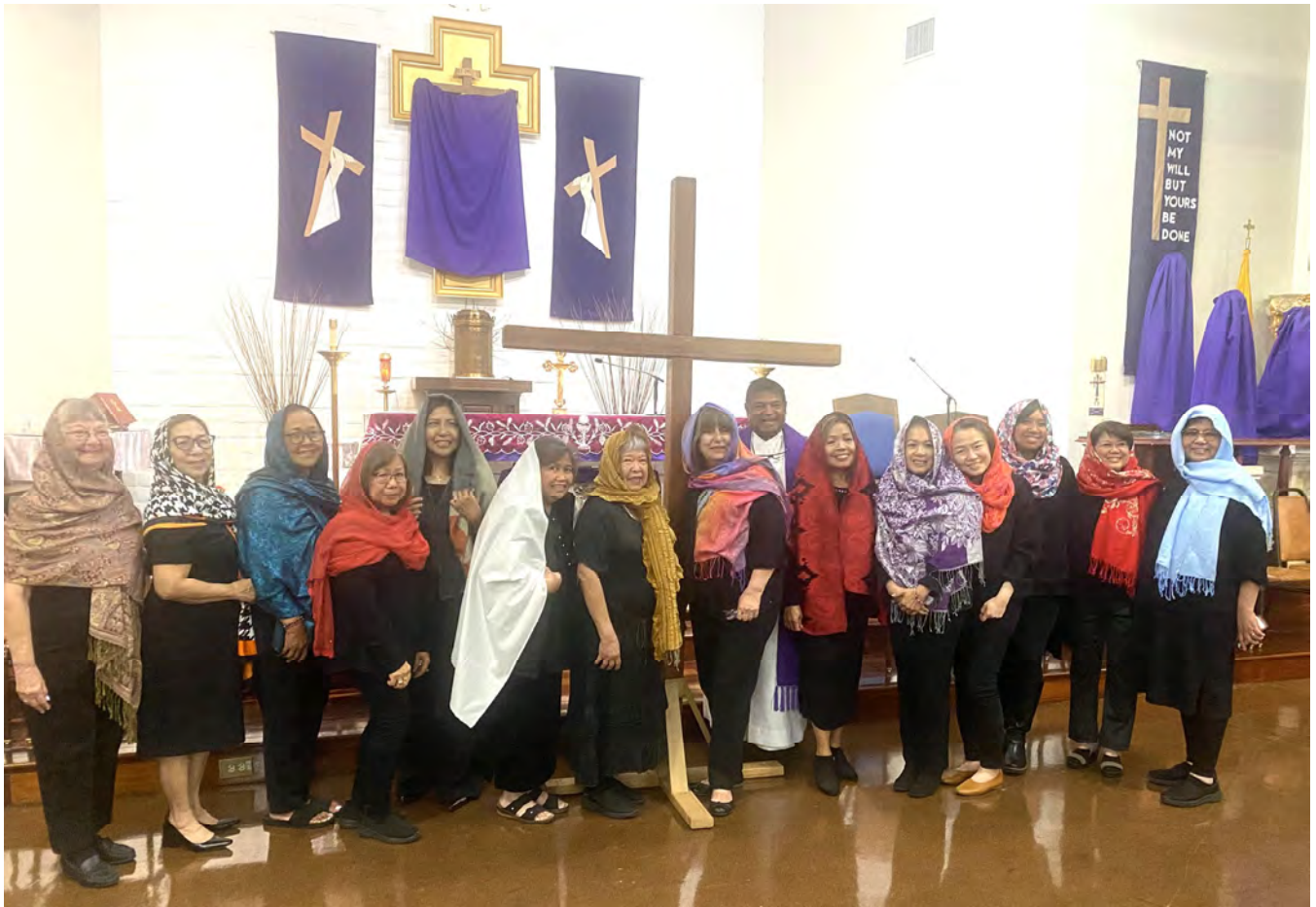
Women of the Cross - April 11, 2025